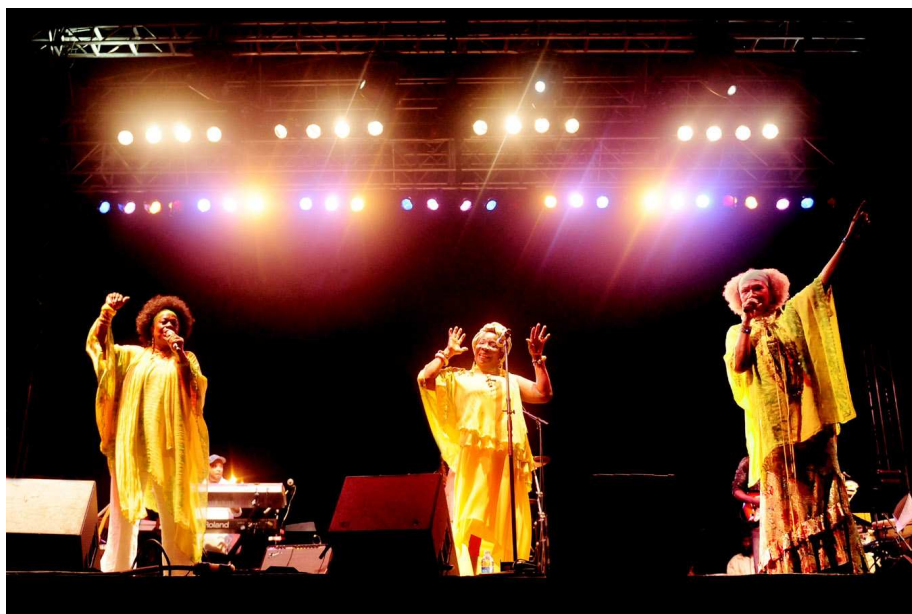
Outfits designed by Cedella Marley

Over 20,000 fans flooded the Delmar Race Track in San Diego on July 30. While 17,000 converged at the Hollywood Bowl in Hollywood, California on July 31. They were there to witness and celebrate Reggae Night X-Tuff Gong Worldwide & Ziggy Marley Salute Legends of Reggae. This event organized by Ziggy Marley, honors the musical contributions and works of the legends