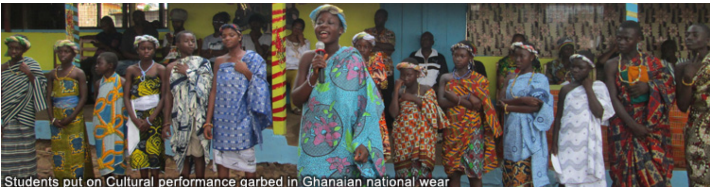
Students put on Cultural performance garbed in Ghanaian national wear