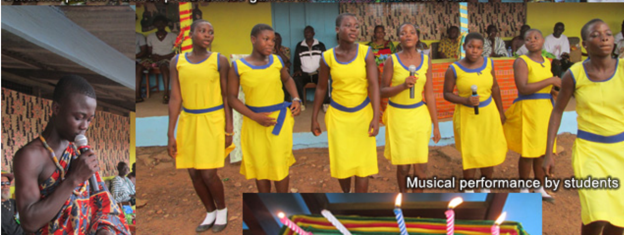
Musical performance by students