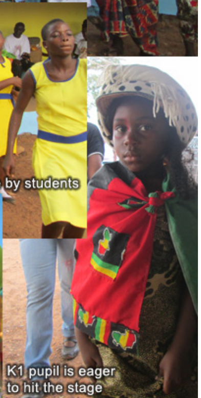
K1 pupil is eager to hit the stage