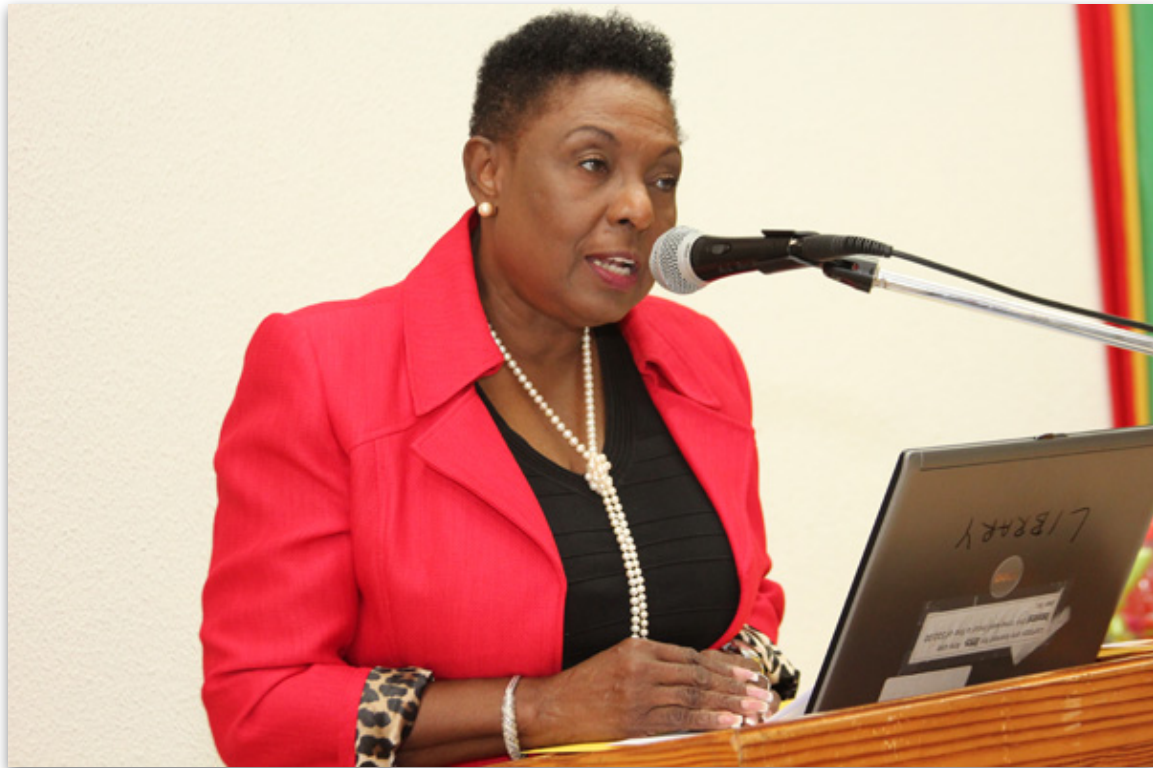
Member of Parliament (Jamaica), Ms. Olivia Babsy Grange

I am really grateful for the opportunity to welcome the students, guests, friends, well wishers and to acknowledge the presence of members of the huge Marley clan and the Ethiopian Orthodox Church to this very important event.